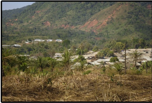
A small portion of the beautiful view from the top of our hill. The white buildings across the valley are part of the mining company. The building second from the right is the company guest house where we stay when visiting Baomahun. They graciously house and feed us at no charge. The mountains rising behind these buildings are where mining will soon begin.