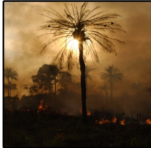
The cut brush being burned in preparation for building to begin. Prior to being cut, the brush was too thick and tall to walk through. Sorry Reverend Al Gore, slash and burn still happens.