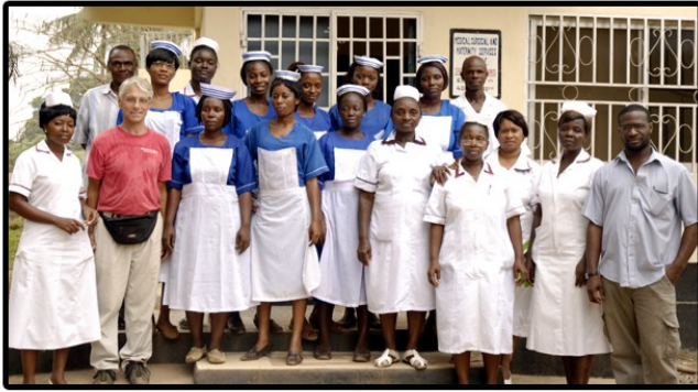
Some of the students and staff at Kindoya Hospital. The nurses wearing blue are in training.