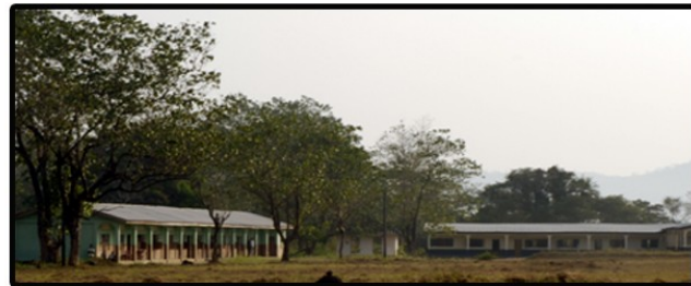
Koyeima boys' school where we will be holding church services.